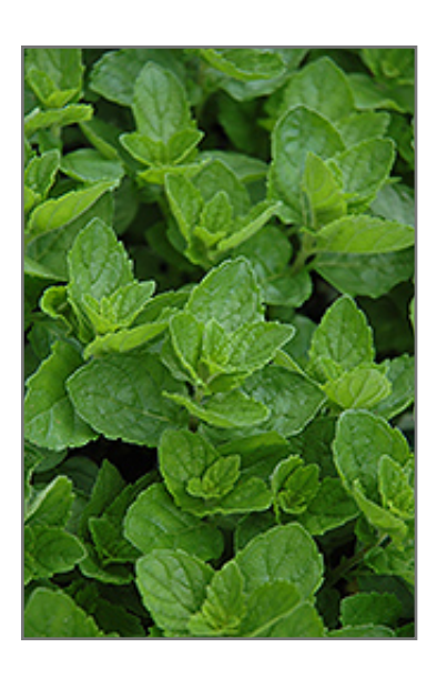
Spearmint foliage