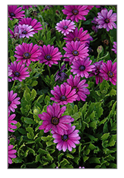
Akila Purple African Daisy flowers

830 W Liberty Dr. Liberty, MO 64068 816.781.0001