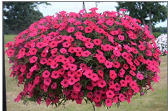
Supertunia Vista Fuchsia Petunia in bloom