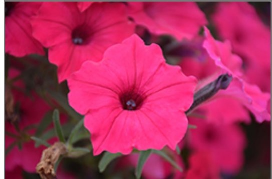
Supertunia Vista Fuchsia Petunia flowers