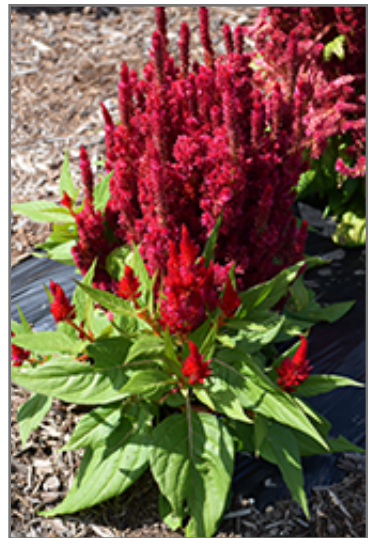
Fresh Look Red Celosia in bloom