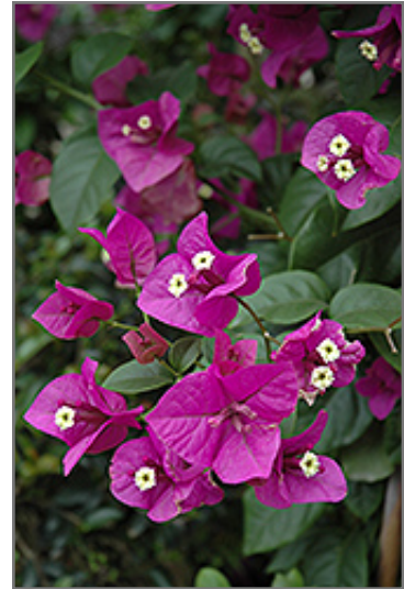
Purple Queen Bougainvillea flowers