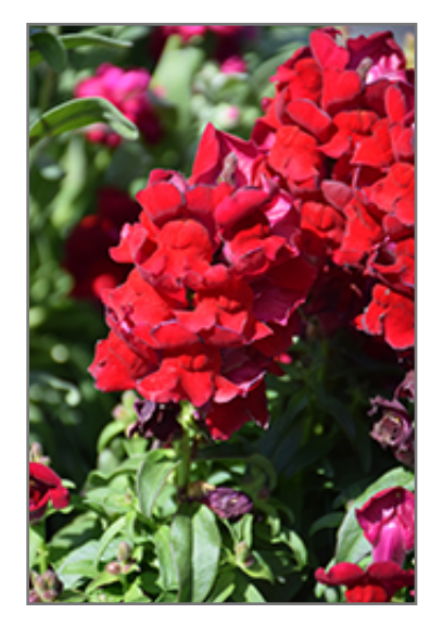
Snapshot Red Snapdragon flowers

830 W Liberty Dr. Liberty, MO 64068 816.781.0001