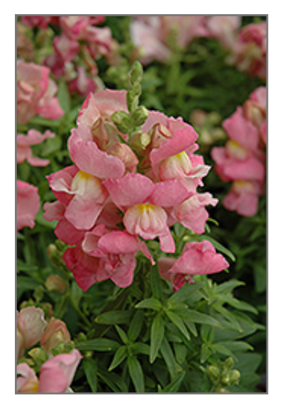
Snapshot Pink Snapdragon flowers

830 W Liberty Dr. Liberty, MO 64068 816.781.0001