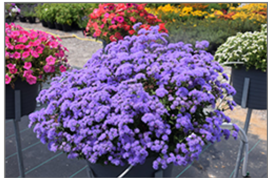
Artist Blue Flossflower in bloom