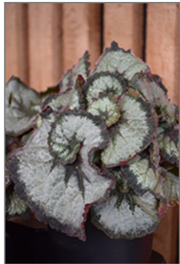
Escargot Begonia foliage