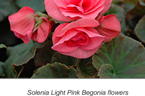
Solenia Light Pink Begonia flowers

Height: 12 inches Spread: 12 inches Spacing: 10 inches Sunlight: ○ ● Hardiness Zone: (annual) Other Names: Hiemalis Begonia