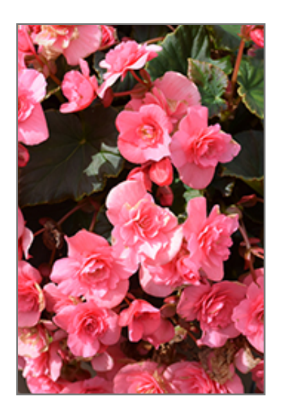
Solenia Light Pink Begonia flowers

This is a high maintenance plant that will require regular care and upkeep, and usually looks its best without pruning, although it will tolerate pruning. Deer don't particularly care for this plant and will usually leave it alone in favor of tastier treats. Gardeners should be aware of the following characteristic(s) that may warrant special consideration;