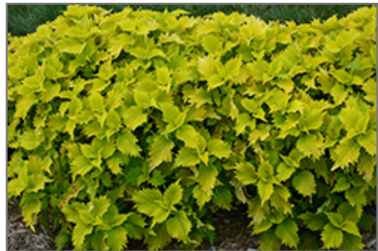
Wasabi Coleus