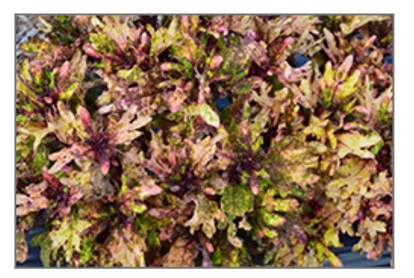
Mint Mocha Coleus foliage

Mint Mocha Coleus is an herbaceous annual with an upright spreading habit of growth. Its relatively fine texture sets it apart from other garden plants with less refined foliage.