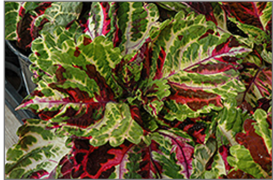
Kong Mosaic Coleus foliage