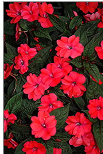
SunPatiens Compact Deep Rose New Guinea Impatiens flowers

This plant will require occasional maintenance and upkeep, and should not require much pruning, except when necessary, such as to remove dieback. It is a good choice for attracting bees and butterflies to your yard. It has no significant negative characteristics.