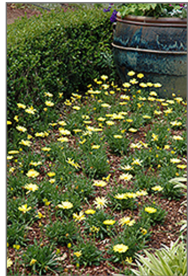
Voltage Yellow African Daisy flowers