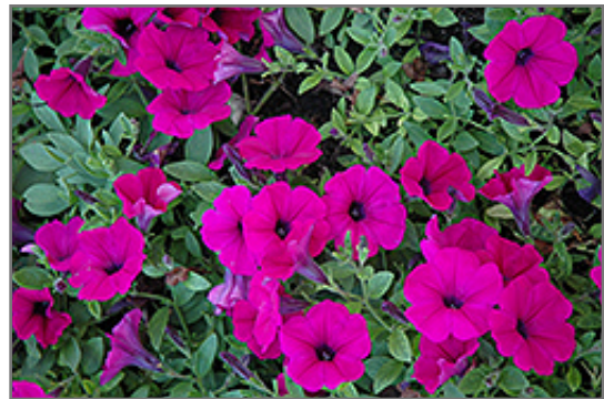
Wave Purple Classic Petunia flowers