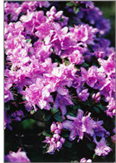
Ramapo Rhododendron flowers