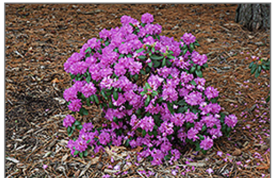
Compact P.J.M. Rhododendron in bloom