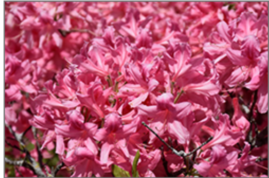
Rosy Lights Azalea flowers

Rosy Lights Azalea is recommended for the following landscape applications;