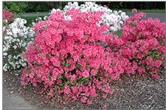
Rosy Lights Azalea in bloom