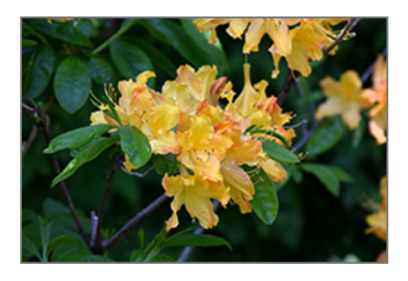
Golden Lights Azalea flowers

830 W Liberty Dr. Liberty, MO 64068 816.781.0001