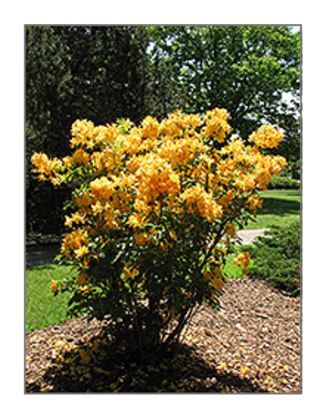
Golden Lights Azalea in bloom