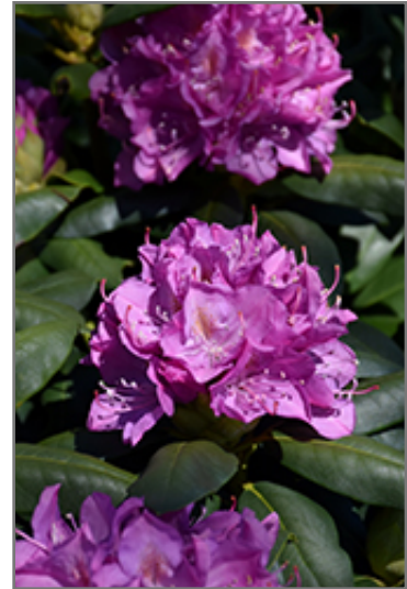
Roseum Elegans Rhododendron flowers