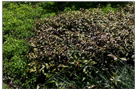
Scarletta Fetterbush