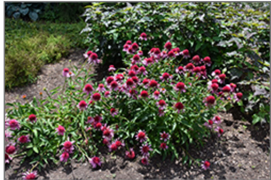
Double Scoop Bubble Gum Coneflower in bloom