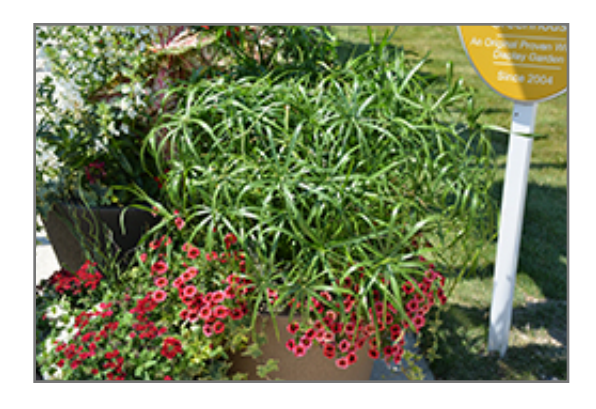
Baby Tut Umbrella Grass

830 W Liberty Dr. Liberty, MO 64068 816.781.0001