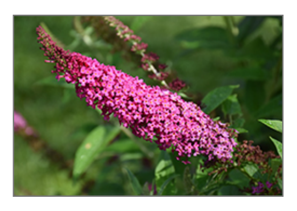
Miss Molly Butterfly Bush flowers

830 W Liberty Dr. Liberty, MO 64068 816.781.0001