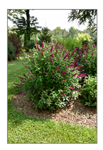
Miss Molly Butterfly Bush in bloom