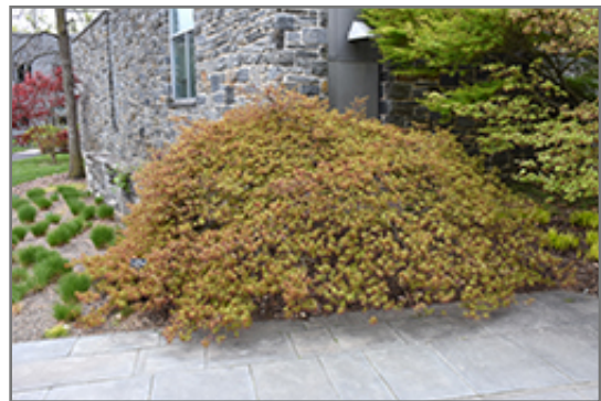
Spring Delight Japanese Maple