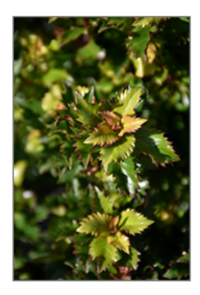
Little Rascal Meserve Holly foliage

8424 Farley St. Overland Park, KS 66212 913.642.6503