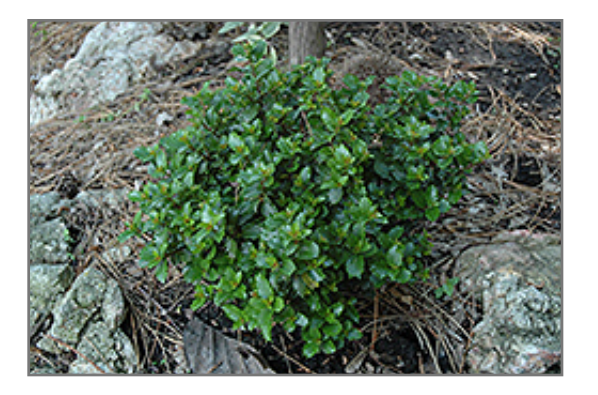
Little Rascal Meserve Holly