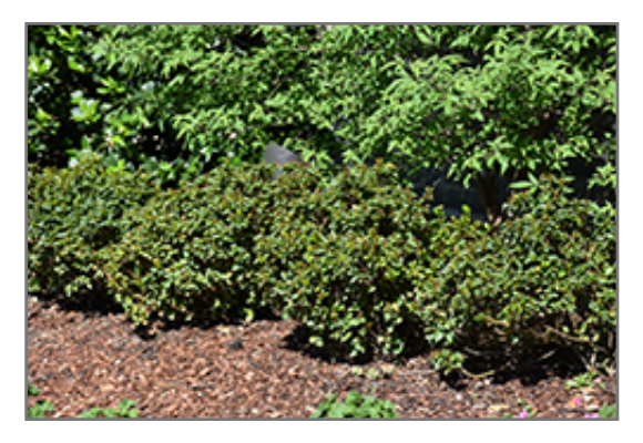
Little Rascal Meserve Holly

This shrub does best in full sun to partial shade. You may want to keep it away from hot, dry locations that receive direct afternoon sun or which get reflected sunlight, such as against the south side of a white wall. It requires an evenly moist well-drained soil for optimal growth, but will die in standing water. It is very fussy about its soil conditions and must have rich, acidic soils to ensure success, and is subject to chlorosis (yellowing) of the foliage in alkaline soils. It is somewhat tolerant of urban pollution. Consider applying a thick mulch around the root zone in winter to protect it in exposed locations or colder microclimates. This particular variety is an interspecific hybrid.