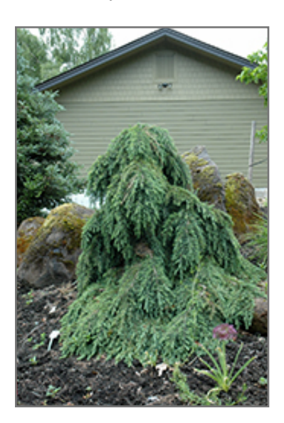
Feelin' Blue Deodar Cedar