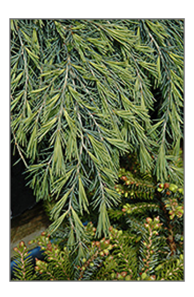
Feelin' Blue Deodar Cedar foliage