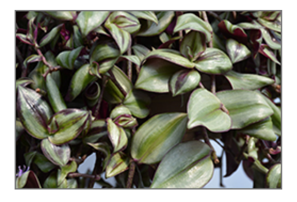
Wandering Jew foliage

830 W Liberty Dr. Liberty, MO 64068 816.781.0001