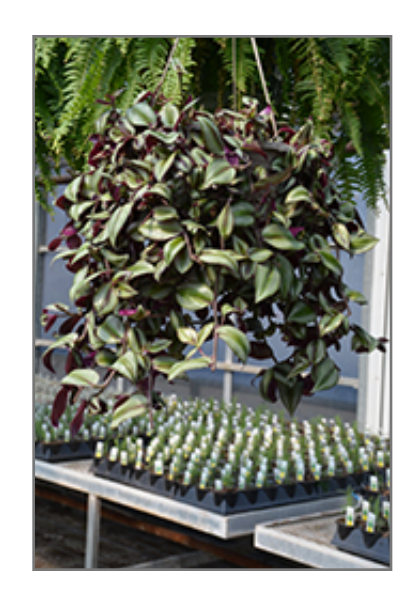
Wandering Jew