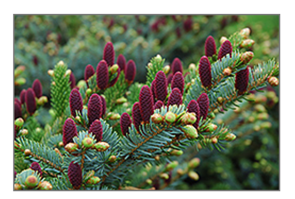
Red Cone Spruce fruit

Red Cone Spruce is recommended for the following landscape applications;