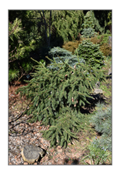
Red Cone Spruce

8424 Farley St. Overland Park, KS 66212 913.642.6503