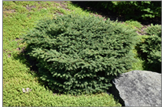
Birds Nest Spruce