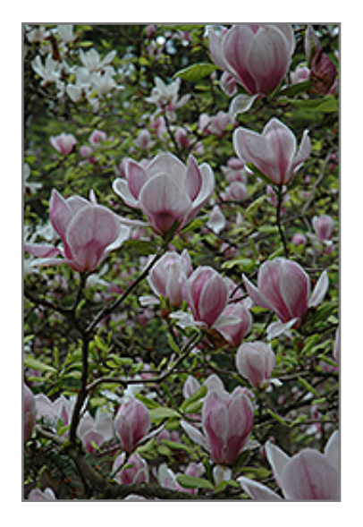
Saucer Magnolia (tree form) flowers

830 W Liberty Dr. Liberty, MO 64068 816.781.0001