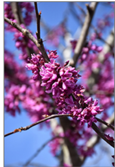
Eastern Redbud (tree form) flowers