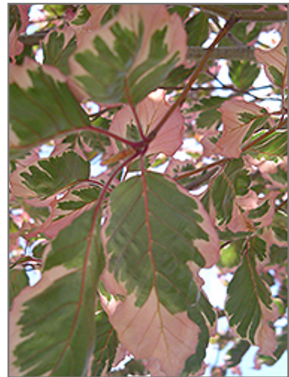
Tricolor Beech foliage