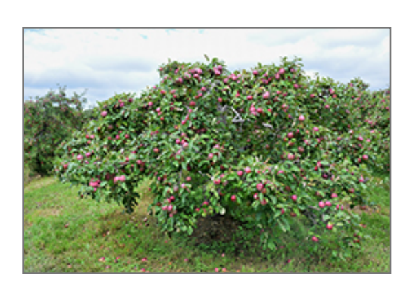
Macintosh Apple fruit

This tree is typically grown in a designated area of the yard because of its mature size and spread. It should only be grown in full sunlight. It prefers to grow in average to moist conditions, and shouldn't be allowed to dry out. It is not particular as to soil type or pH. It is highly tolerant of urban pollution and will even thrive in inner city environments. This particular variety is an interspecific hybrid.