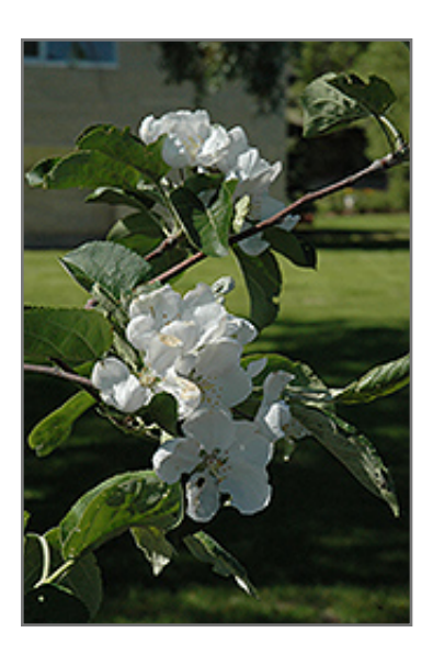
Macintosh Apple flowers