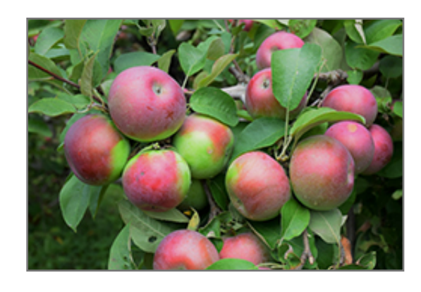
Macintosh Apple fruit

Macintosh Apple features showy clusters of lightly-scented white flowers with shell pink overtones along the branches in mid spring, which emerge from distinctive pink flower buds. It has forest green deciduous foliage. The pointy leaves turn yellow in fall. The fruits are showy red apples with hints of light green, which are carried in abundance in early fall. The fruit can be messy if allowed to drop on the lawn or walkways, and may require occasional clean-up.