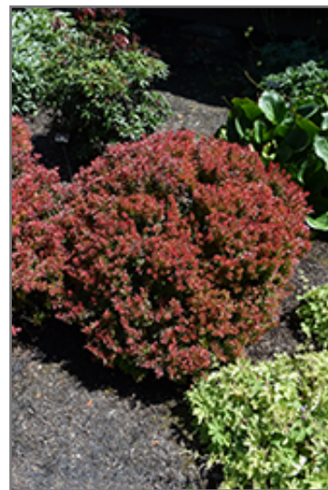
Golden Ruby Barberry