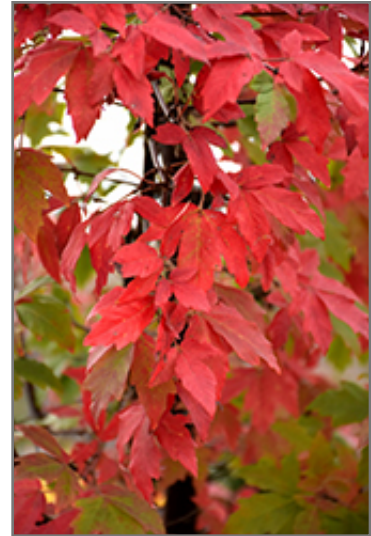
Paperbark Maple in fall

This tree does best in full sun to partial shade. It prefers to grow in average to moist conditions, and shouldn't be allowed to dry out. It is not particular as to soil type or pH. It is somewhat tolerant of urban pollution. This species is not originally from North America.