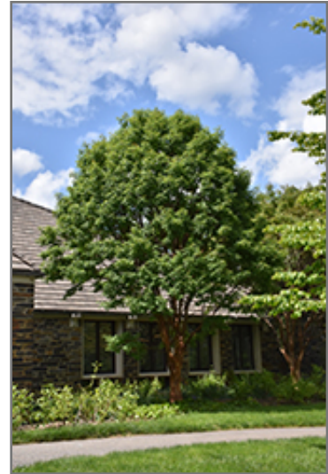
Paperbark Maple